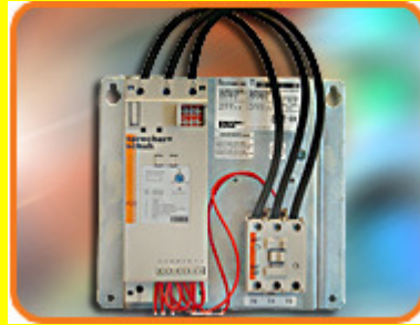
Wired inside the delta PCEC Hydraulic Elevator

An LED display indicates operating status and fault condition (overload, over temperature, phase reversal/phase loss, phase imbalance, shorted SCR, start fault). This enables speedy diagnosis and quick resolution of problems.